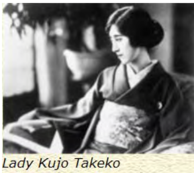
Lady Kujo Takeko

Commemorating the spirit of community service and giving as exemplified by Lady Takeko Kujo, 1887 – 1928