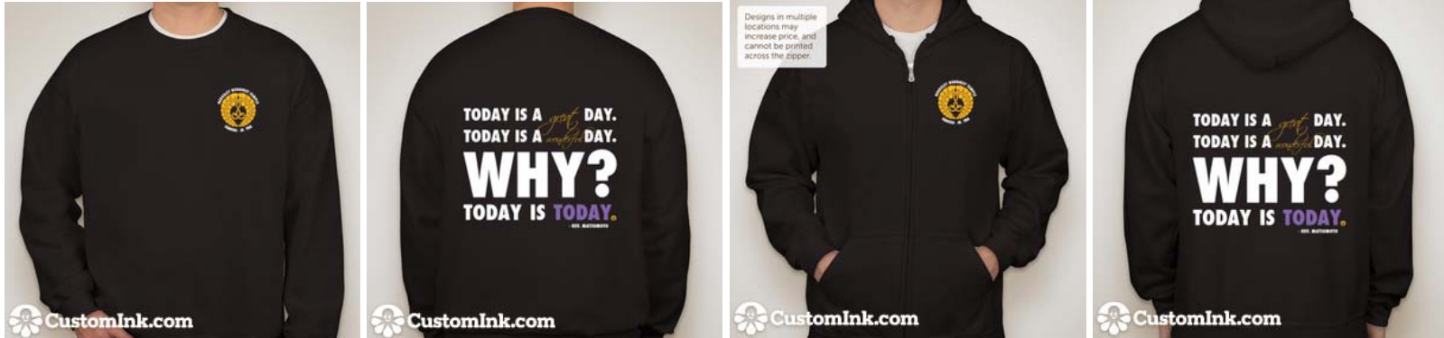
Lightweight Crewneck Sweatshirt $25.00